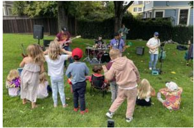
Top row: Misunderstood, Middle Dog; Middle Row: Olive Pants, UNAMAZ; Bottom Row: Lightning Made Rhinos.